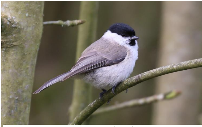
Marsh Tit Poecile palustris